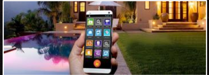
Security & Automation