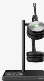
Yealink WH62 Stereo Teams

Total min. cost over 36 months $1,258.20