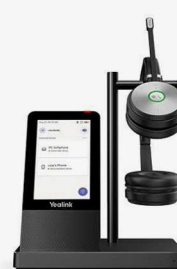
Yealink WH66 Dual Teams

Total min. cost over 36 months $1,618.20